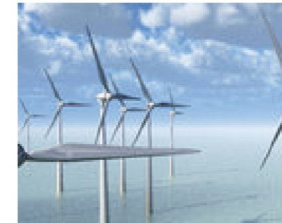
Latin America's Renewable Energy Revolution LatAm Investors