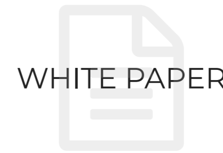
What is Micro-Molding?