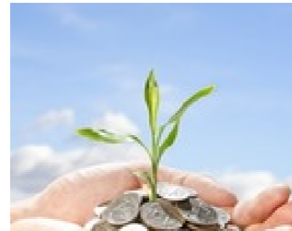
Where is the clever money going? MarketViews