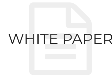
Your Partner and Specialist for Advanced Microelectronics